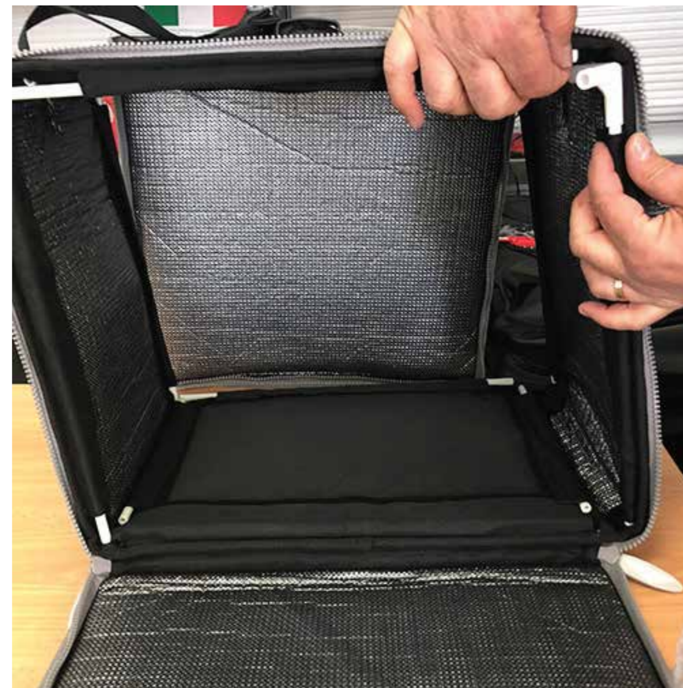
TAKE CORNER CONNECTORS AND SECURE PIPE FRAME