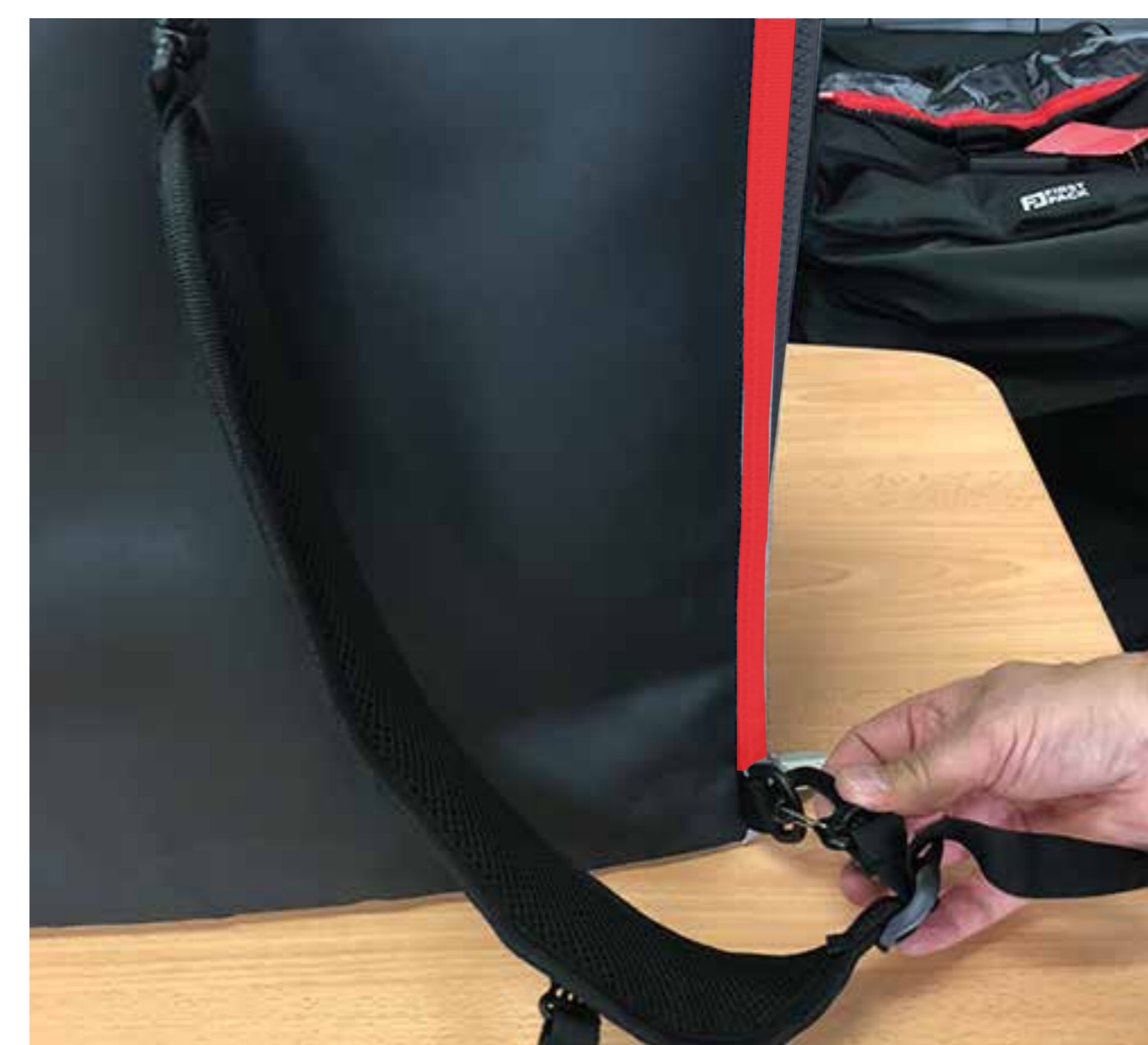
CLIP BOTTOM OF STRAPS TO METAL LOOPS AT REAR/BOTTOM OF BAG