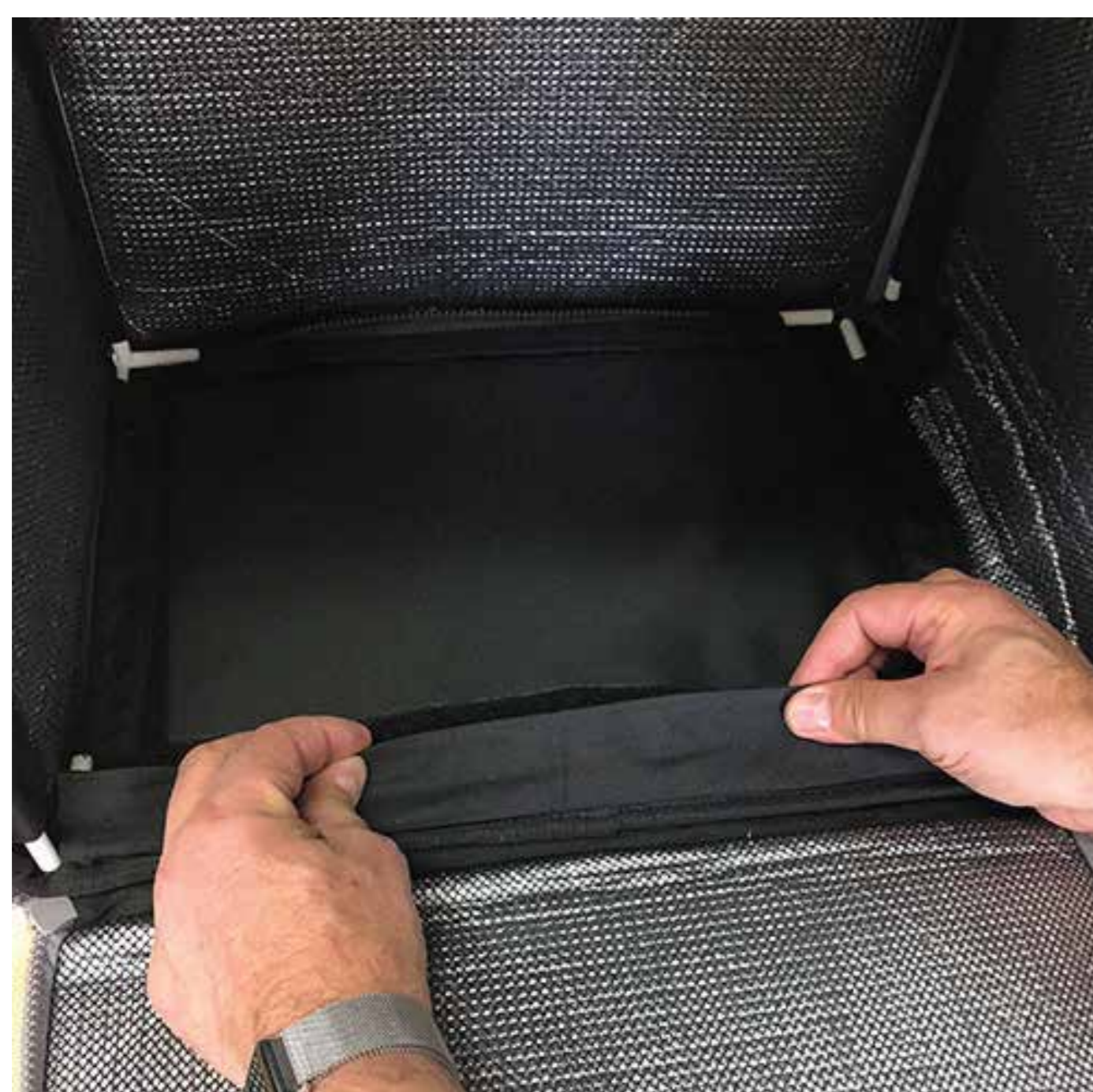
FIND VELCRO FLAP IN FRONT OF FLOOR PANEL