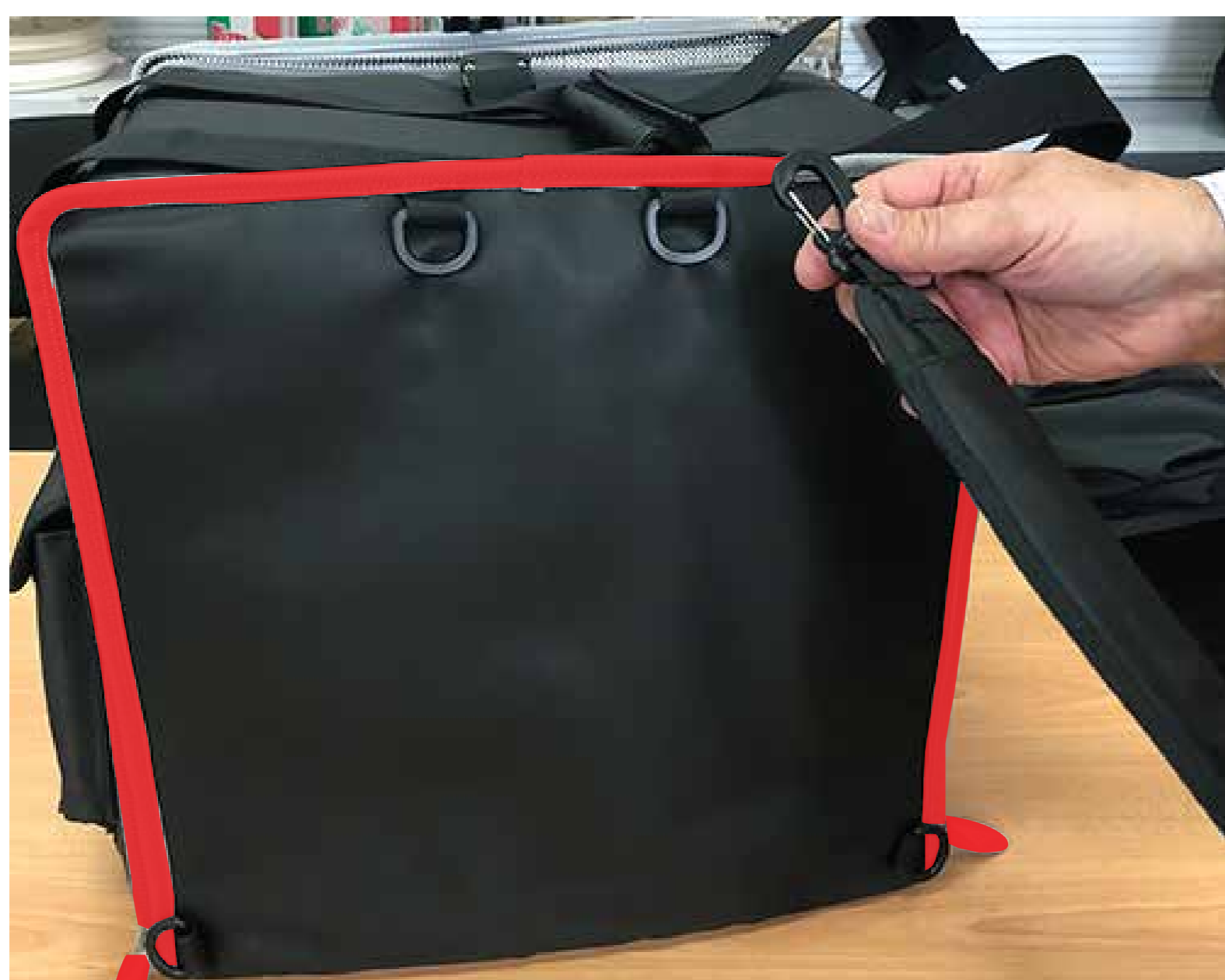
FIND DETACHABLE BACK PACK STRAPS SUPPLIED FLAT