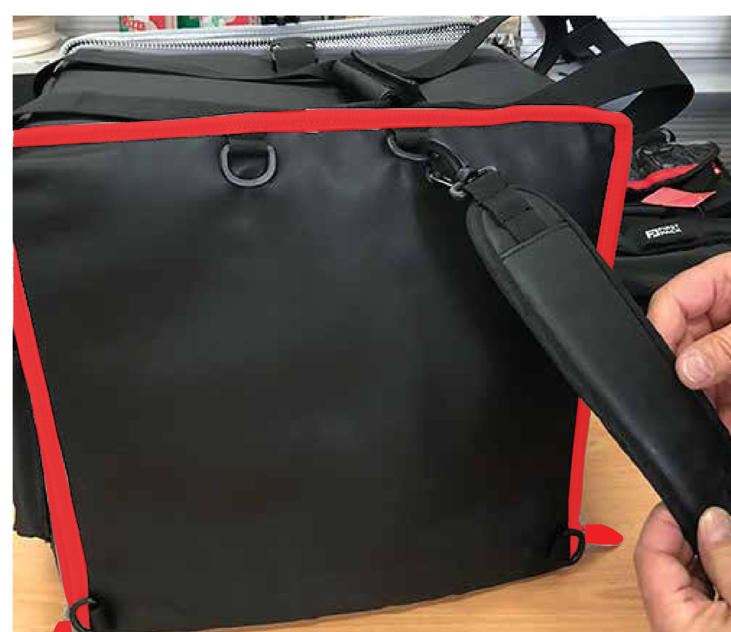
CLIP TOP OF STRAPS TO METAL LOOPS AT REAR/TOP OF BAG