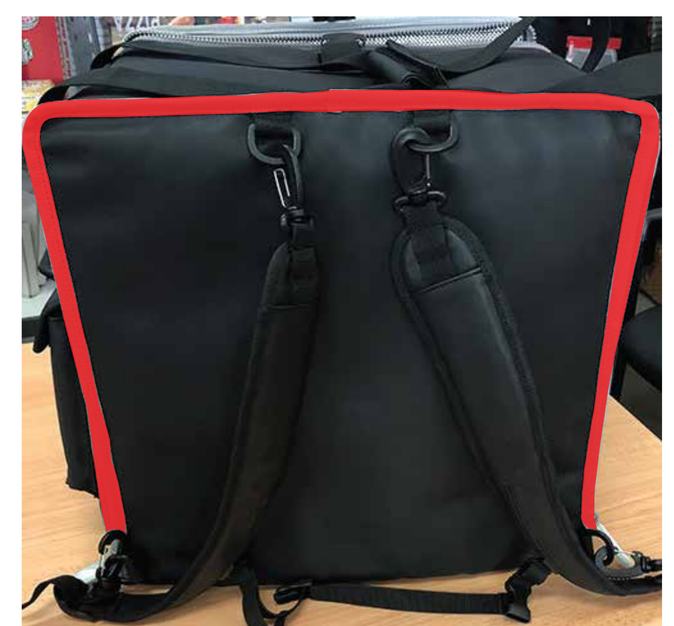
FINISHED BACK PACK STRAPS