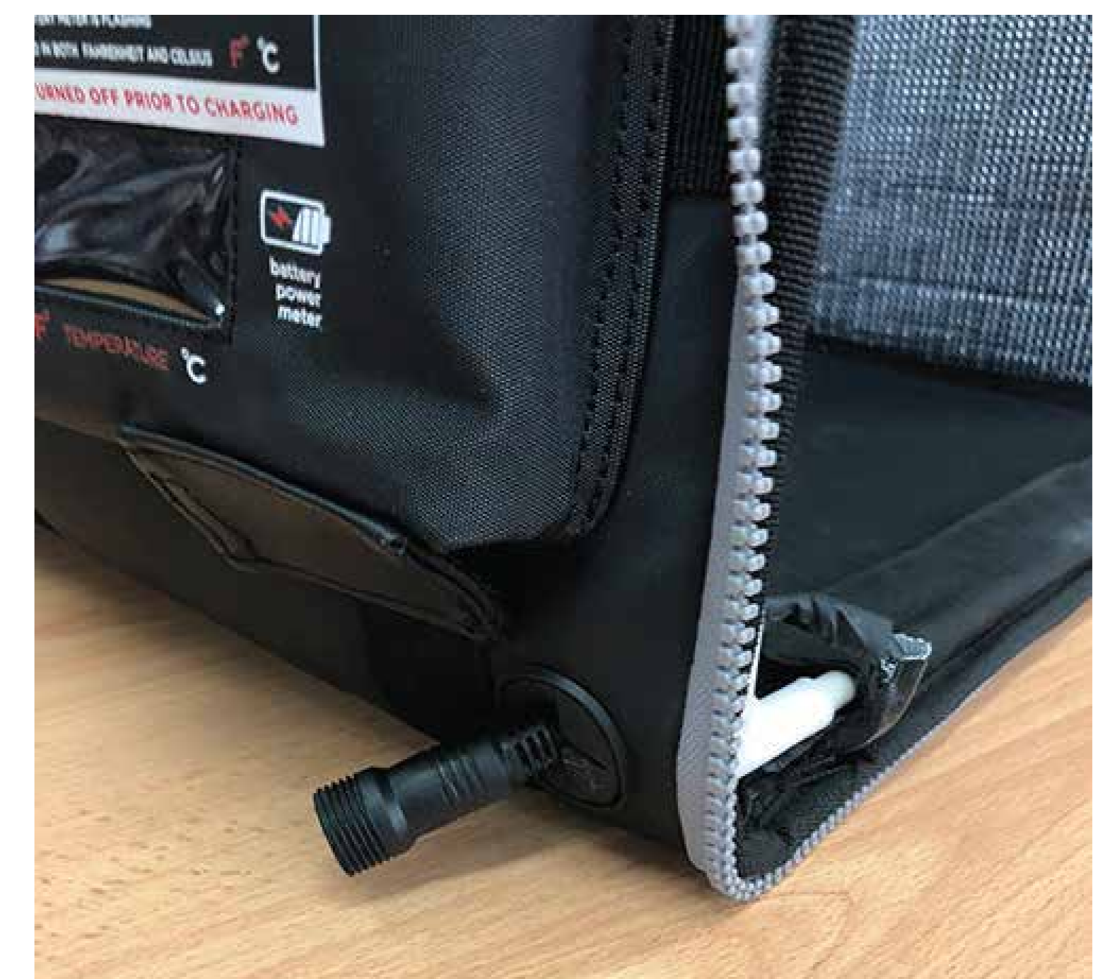
PLACE HEAT PAD CABLE THROUGH RUBBER CABLE PORT