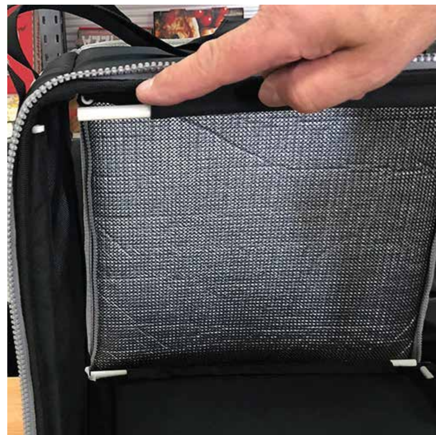
FRAME PIPE COMES POSITIONED IN VELCRO FLAP