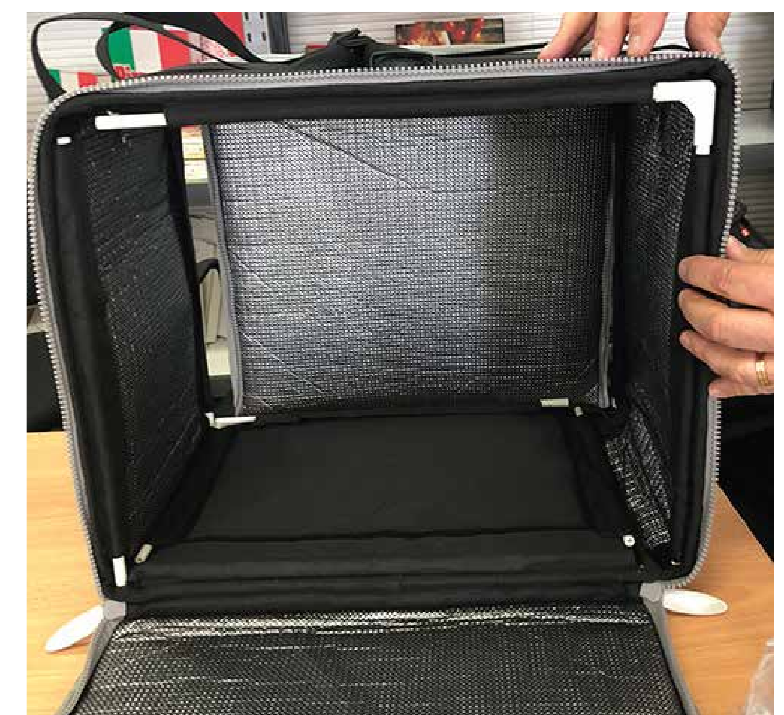
CREATES RIDGIDITY IN ALL 8 CORNERS