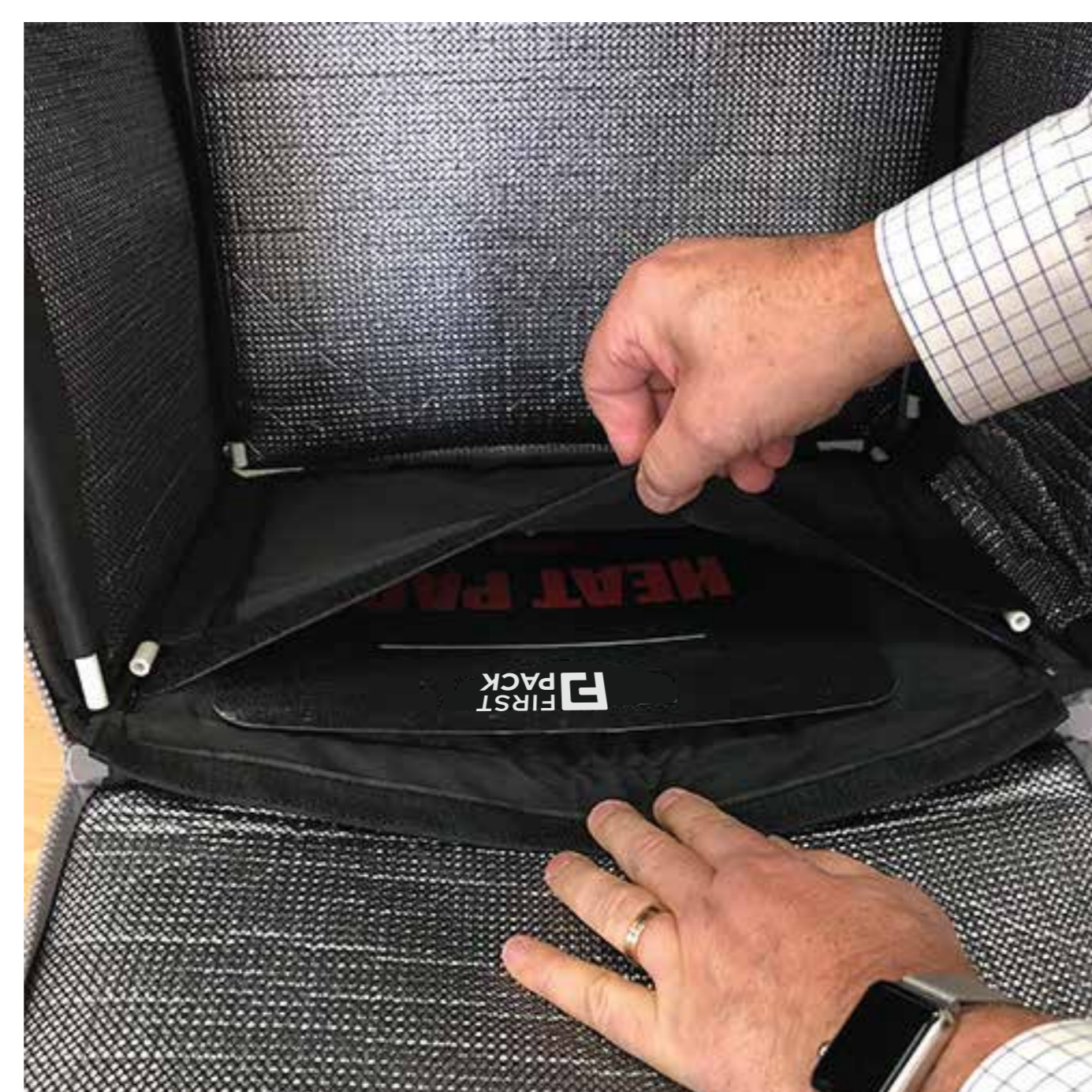
POSITION HEAT PAD IN POCKET WITH CABLE FACING REAR (note - sample has Heat Pad already loaded)